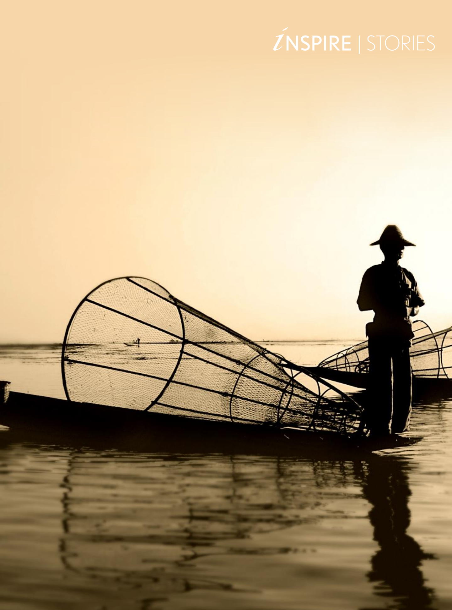
A fisherman prepares for work on the waters of Inle Lake, Myanmar Cover photo: Walking on the terraces of rice in Lao Cai in northern Vietnam