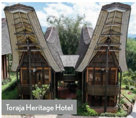
Toraja Heritage Hotel

Travel to remote regions of Sulawesi, one of Indonesia's most diverse islands, to discover stunning landscapes and the fascinating burial culture of the Toraja Highlands people. Consider adding an extension to Northern Sulawesi for some of the world's best micro-diving, or three nights at the luxurious Wakatobi Resort in Southeast Sulawesi.